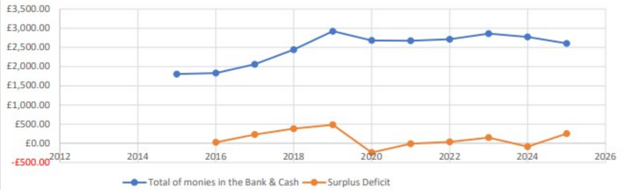
Approximate Club Account Year End Values